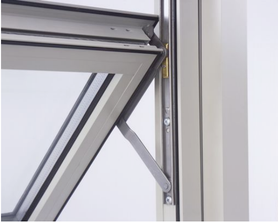
Heavy Duty 4-Bar Hinge